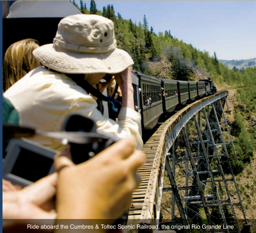
Ride aboard the Cumbres & Toltec Scenic Railroad, the original Rio Grande Line