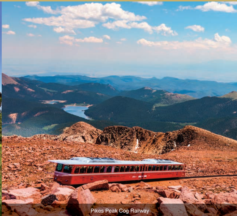
Pikes Peak Cog Railway

fired, steam-operated and are maintained in their original condition. Later, check into the Sky Ute Casino Resort where you may wish to give “Lady Luck” a try. Meals: B, D